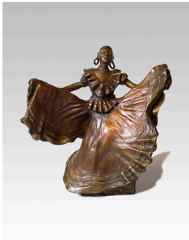
Title: Joyful Description: Bronze Folklorico Dancer