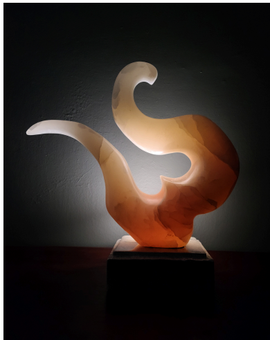
Title: Lyre Description: Onyx mounted on marble

Artist Statement: Primarily a stone carver & sculptor, my creative interests are far-ranging, covering many mediums and styles to suit most needs to complete a particular project. My abstract stone sculptures have been described as water-like, flowing and liquid, or as if someone had scooped into the stone like ice cream. As a whole my work ranges from ribbon-like abstracts to classically inspired figures, bas-relief and whimsical characters; they draw the viewer in, whispering, inviting to come closer. My military illustrations, paintings and drawings are award winning, some in the permanent collection housed at The Pentagon. A retired Air Force senior NCO, now working as a Medical Illustrator in San Antonio, I have the honor of being the Chairperson for Forward, Arts! , an art immersion program created to service veterans living with PTSD. I'm also an active member of the Texas Sculpture Group, Texas Society of Sculptors, San Antonio Art League & Museum, and Air Force Art Program.