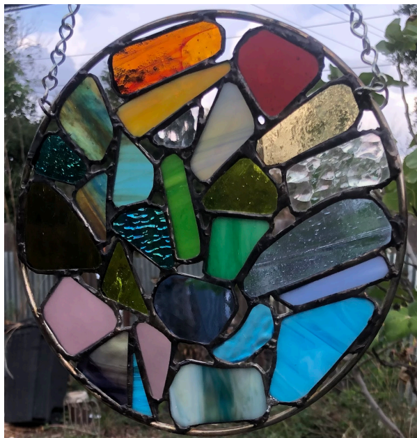
Untitled, 8" diameter, stained tumbled glass, 10" metal ring, zinc chain

I create my own designs and my own patterns. I try to make pieces affordable by limiting the size of panels and using small but colorful glass pieces that I find in the "scrap" bins at stained glass stores or broken pieces found at estate sales. I hand pick every piece for their blended and vibrant colors, texture, and movement in the glass. Sometimes, a singular piece of glass will inspire the finished product. I prefer the organic look of curves and circular cuts over straight lines because it creates a sense of movement. I experiment by including other glass materials in the panels. All are welcome to visit my studio!"