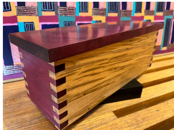
Purple Box- Purple Heart/Maple Ambrosia- 13"x5" 2023