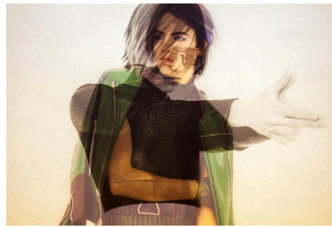
Bang! Bang!, Digital Archival Photograph, 36"x24", 2022