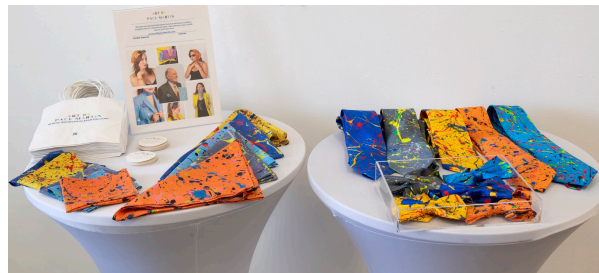
Fashion Accessories inspired by the X-Factor Multicolored Universes Painting: Pocket squares, neck ties, bow ties, scarves